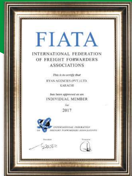
International Federation of Freight Forwarders Association