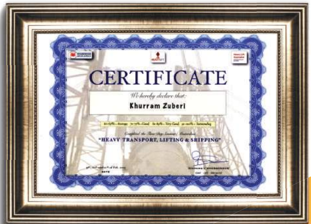
Heavy Transport, Lifting & Shipping