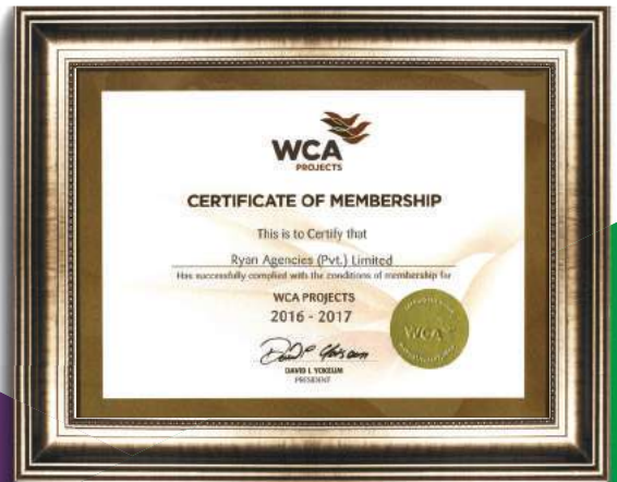
World Cargo Alliance Projects Network