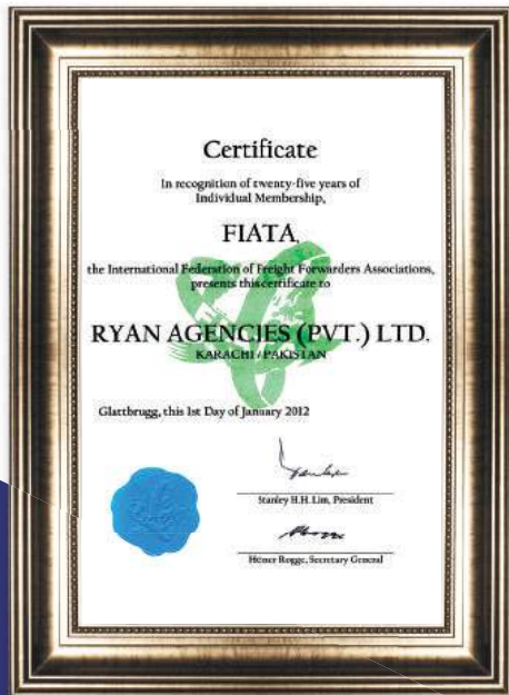
FIATA 25 YEARS