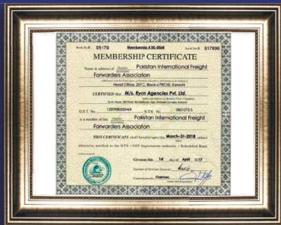
Pakistan International Freight Forwarders Association