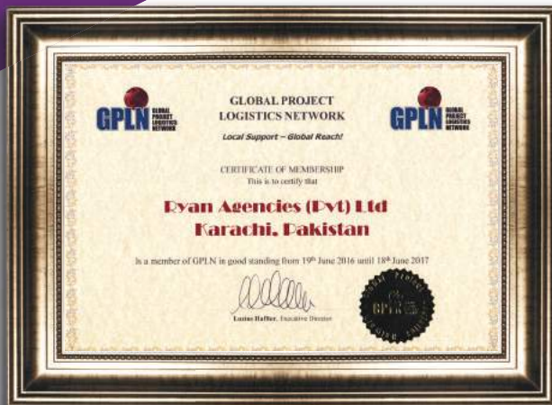
Global Project Logistics Network