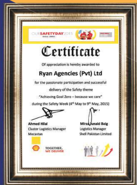
Shell Safety Day